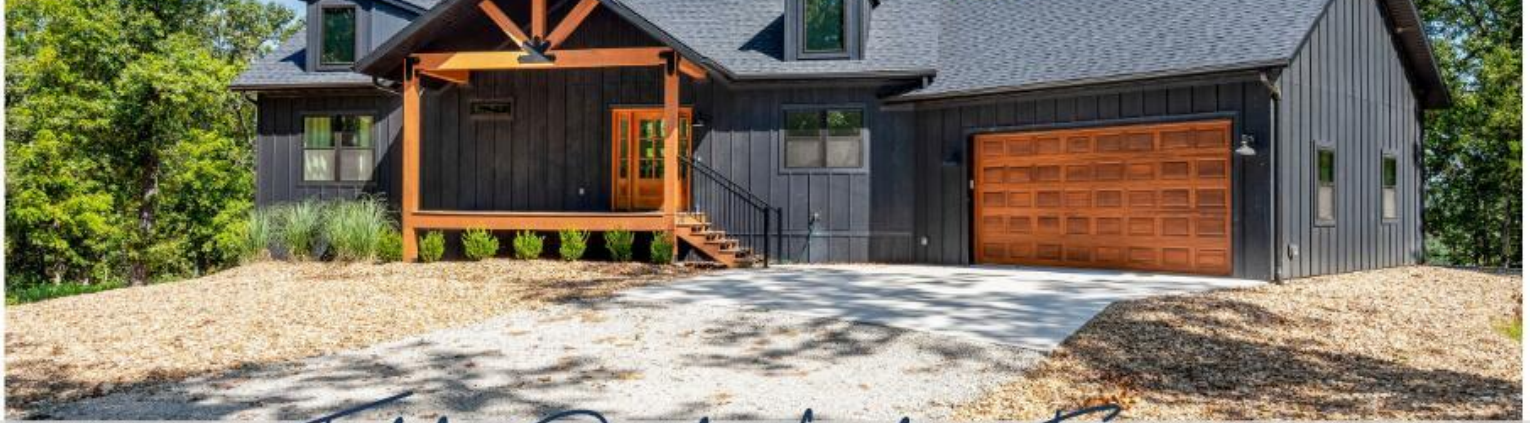
Table Rock Lake Front

New Construction - Fully Furnished - Beautiful Views - 10.81 Acres